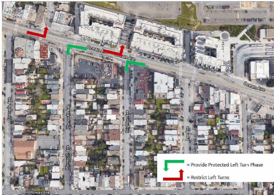
Figure 2: Recommended Improvements to Reduce Transit Travel Times